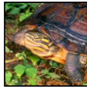
Vietnam leaf turtle Mauremys annamensis Vietnam (Indo-Burma Hotspot)