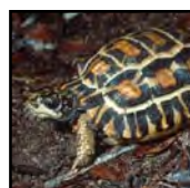
Flat-tailed tortoise Pyxis planicauda Madagascar (Madagascar and Indian Ocean Islands Hotspot) John L. Behler, Wildlife Conservation Society