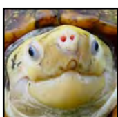
Sulawesi forest turtle Leucocephalon yuwonoi Indonesia (Wallacea Hotspot) Chris Tabaka, DVM