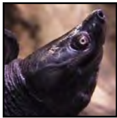
River terrapin Batagur baska S.E. Asia (Indo-Burma & Sundaland Hotspots)