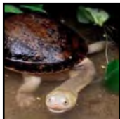
Roti snake-necked turtle Chelodina mccordi Southern Indonesia (Wallacea Hotspot)