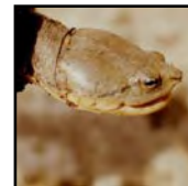
Dahl's toad-headed turtle Batrachemys dabli Colombia Russell A. Mittermeier, Conservation International