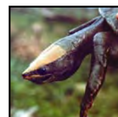
Central American river turtle Dermatemys mawii Central America (Mesoamerica Hotspot)