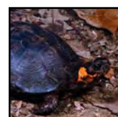
Bog turtle Clemmys mublenbergii United States