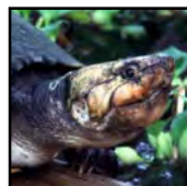
Madagascar big-headed turtle Erymnochelys madagascariensis Madagascar (Madagascar and Indian Ocean Islands Hotspot) Gerald Kuchling