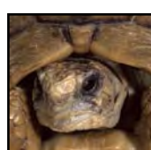
Egyptian tortoise Testudo kleinmanni S.E. Mediterranean (Mediterranean Basin Hotspot)

This list of the world's top 25 most endangered tortoises and freshwater turtles was compiled by the Turtle Conservation Fund (TCF)—a partnership of the Turtle Conservation Fund (TCF)—a partnership of the Center for Applied Biodiversity Science (CABS) at Conservation International (CI), The World Conservation Union Species Survival Commission's (IUCN/SSC) Tortoise and Freshwater Turtle Specialist Group (TFTSG), and IUCN/SSC Turtle Survival Alliance (TSA).