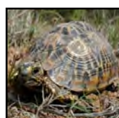
Geometric tortoise Psammobates geometricus South Africa (Cape Floristic Region Hotspot)