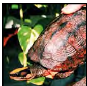
Chinese three-striped box turtle Cuora trifasciata Northern Vietnam & China (Indo-Burma Hotspot) Kurt Buhlmann, Conservation International