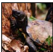
Arakan forest turtle Heosemys depressa Myanmar (Indo-Burma Hotspot)