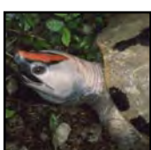
Painted terrapin Callagur borneoensis S.E. Asia (Indo-Burma & Sundaland Hotspots)