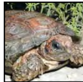
Southern speckled padloper tortoise Homopus signatus cafer South Africa (Succulent Karoo Hotspot)