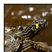
Yellow-blotched map turtle Graptemys flavimaculata United States David E. Collins