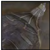
Striped narrow-headed softshell turtle Chitra chitra S.E. Asia (Indo-Burma Hotspot)