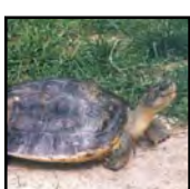
Burmese roofed turtle Kachuga trivittata Myanmar (Indo-Burma Hotspot) Gerald Kuchling