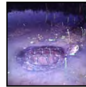
Western swamp turtle Pseudemydura umbrina Australia (Southwestern Australia Hotspot) Gerald Kuchling