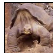
Abingdon Island tortoise (Galapagos Tortoise) Geochelone nigra abingdoni Galapagos Islands (Choco-Darien-Western Ecuador Hotspot)