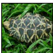
Burmese star tortoise Geochelone platynota Myanmar (Indo-Burma Hotspot)