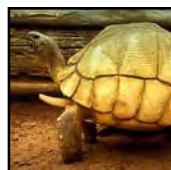
Ploughshare tortoise Geochelone yniphora Madagascar (Madagascar and Indian Ocean Islands Hotspot)