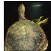
Mary river turtle Elusor macrurus Australia