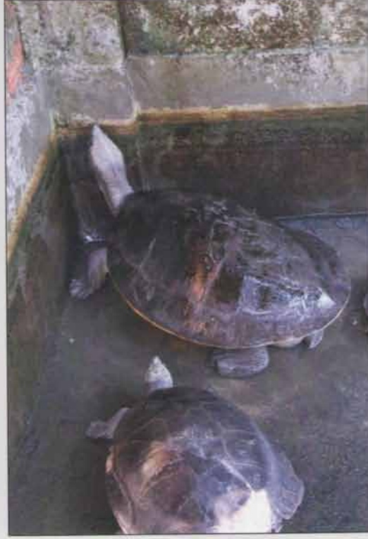
Left: The nesting beach on the Sre Ambel River is guarded 24 hours per day during the nesting and hatching seasons. Pictured here is the guard coming to shore to transport biologists to the nesting beach. Middle: New solar panels will serve to power pumps for moving water from the well to water storage tanks, where the water will be gravity fed into the headstarting facility. Right: Three wild caught River Terrapins ( Batagur affinis ), some of the last of their kind in Indochina, held in captivity for over 10 years at a facility in Koh Kong. These turtles represent valuable genetic additions to the captive program. Major improvements at the Sre Ambel facility are required before these turtles can be moved.

nests were located and protected by project rangers during the 2010 nesting season; one nest contained a total of 11 eggs, of which 10 individuals hatched in early May, and the second a total of five eggs, although only one individual hatched, in early June. Thus, there are 11 new arrivals at the center, in addition to the 118 animals that were already held (47 hatchlings from 2006, 47 hatchlings from 2007, one animal estimated at four years of age captured by a fisherman and handed to the conservation team in early 2008, and 23 hatchlings from 2009). Two new plastic tanks have been purchased to increase the capacity of the center in the short term, but a new and larger facility will likely have to be constructed over the next 12 to 18 months, if a suitable site can be located in the vicinity of the Sre Ambel River.