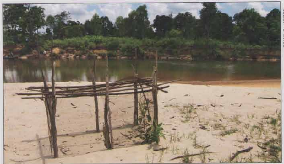
BRIAN D. HORNE

This program represents another outstanding example of the WCS/